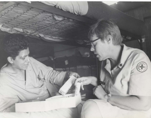
From the Archives Page 4