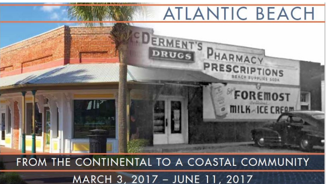
Atlantic Beach Exhibit Page 2

THE NEWSLETTER OF THE BEACHES MUSEUM & HISTORY PARK