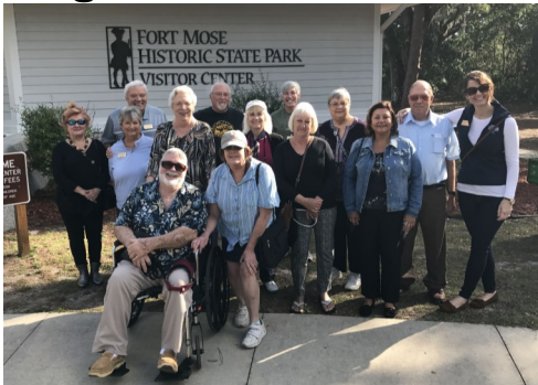
Volunteer News Page 3