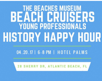
Beach Cruisers History Happy Hour Page 5