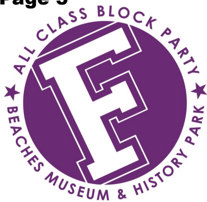
Fletcher All-Class Block Party Page 6