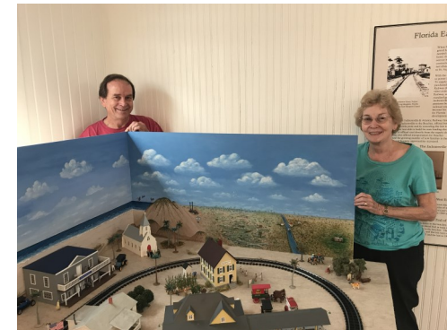
Mineral City Page 2

THE NEWSLETTER OF THE BEACHES MUSEUM & HISTORY PARK