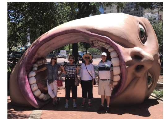
Volunteer News Page 3