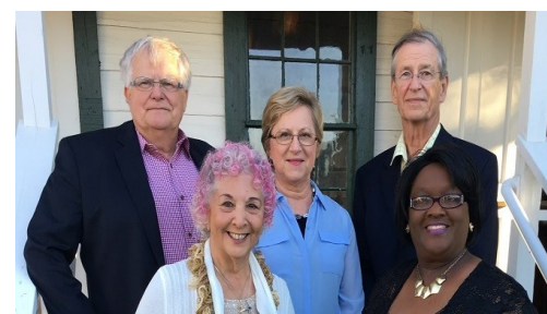
Beach Legends Page 6