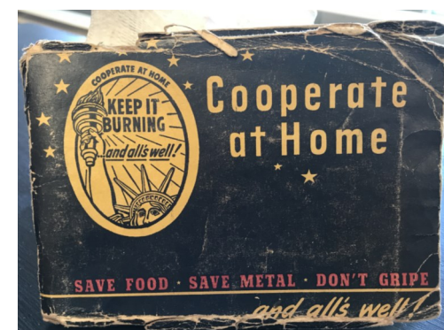
Archives & Collections Page 4