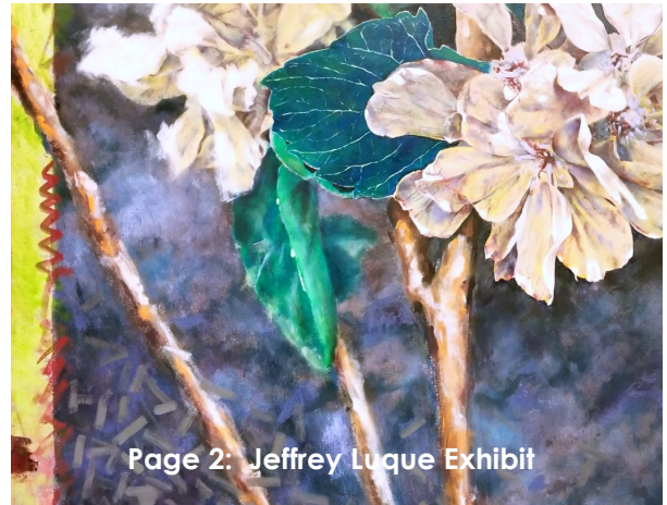
Page 2: Jeffrey Luque Exhibit