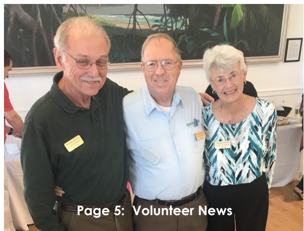
Page 5: Volunteer News