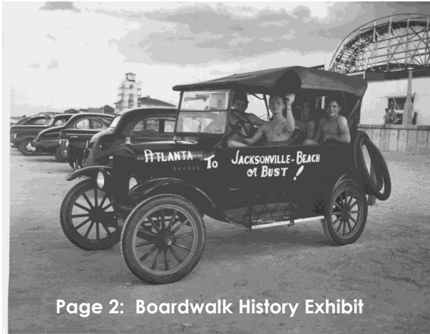
Page 2: Boardwalk History Exhibit

THE NEWSLETTER OF THE BEACHES MUSEUM & HISTORY PARK