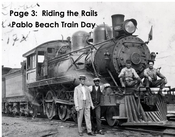
Page 3: Riding the Rails