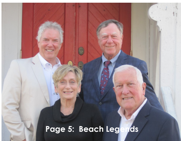
Page 5: Beach Legends