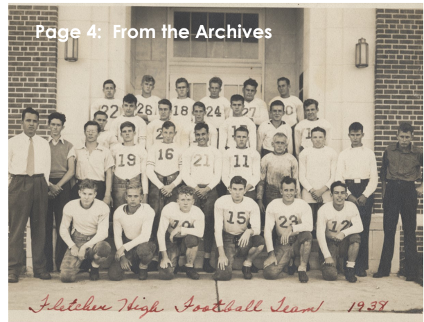
Page 4: From the Archives