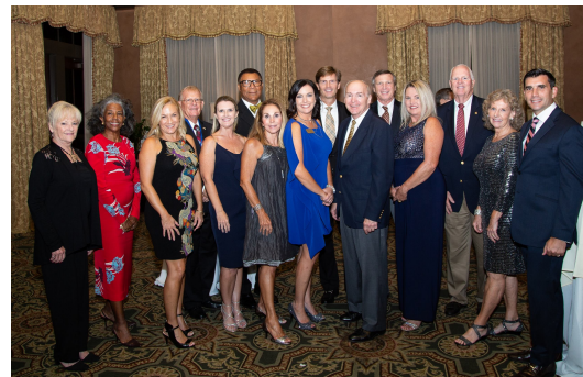
Beaches Museum Board of Directors at Legends

Through our archives and collections, interesting and fun programming, history and art exhibits, we work hard every day to engage as well as educate the community and visitors as to what makes our area special.