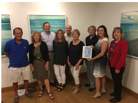
Beaches Museum Strategic Planning Committee

Additionally, we spent the past year working on a new identity for our organization. We'll be known going forward as the "Beaches Museum" with a beautiful brand new logo that captures the vibrant essence of our organization.