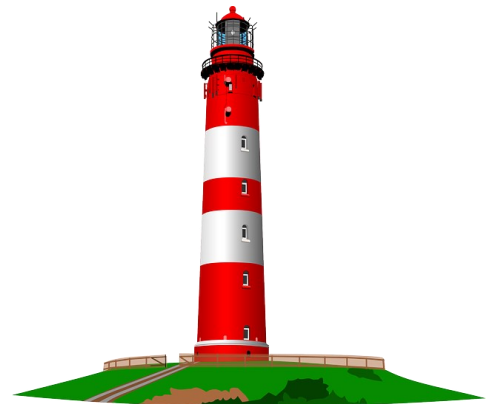
The Mayport Lighthouse