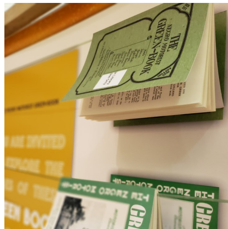
Reproductions of "The Green Book" accompany the traveling exhibit