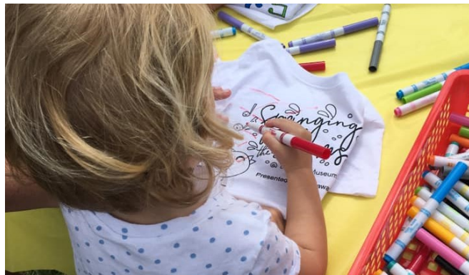
Kids used fabric markers to color their own tee-shirts